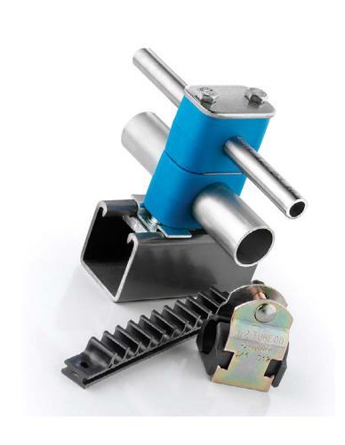
Tubing and Tube Supports