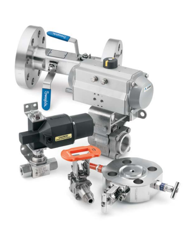
Process Valves and Manifolds