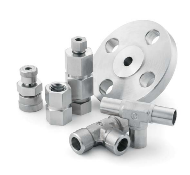
General Industrial Fittings