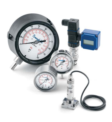
Gauges and Transducers