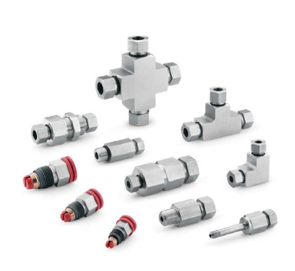
FK - Series Fittings and Valves