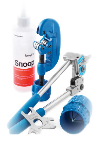
Tools and Accessories