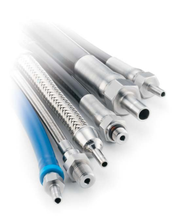
Hose and Flexible Tubing