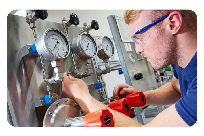
Swagelok Nederland Coenecoop 19 2741 PG Waddinxveen

+31 (0)88 9090 707 info@swagelok.nl nl.swagelok.com